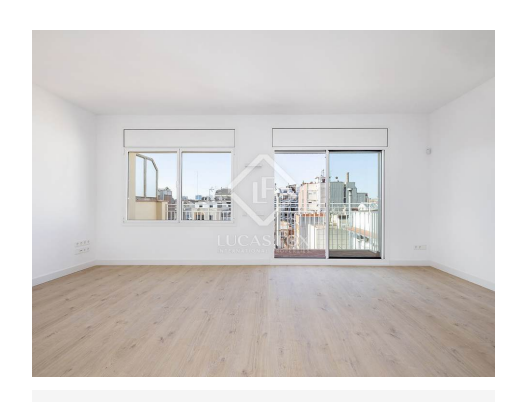
lucasfox.com/go/bcn36439 Terrace, Concierge service, Lift, Transport nearby, Heating