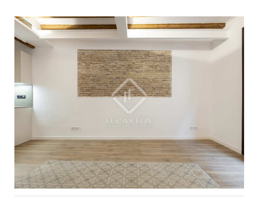
lucasfox.com/go/bcn49155 Concierge service, Lift, Period Building, Storage room, Equipped Kitchen, Air conditioning

Contact us today for more information and to arrange a viewing.