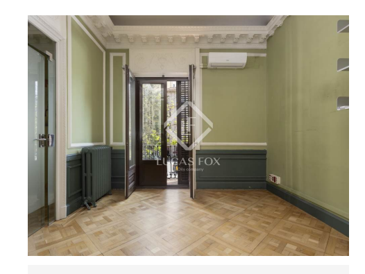
lucasfox.com/go/bcn59607 Concierge service, Lift, Mosaic tile flooring, High ceilings, Modernist building, Transport nearby, To renovate

In the event of a renovation, the final layout would be redesigned and implemented according to the end customer's needs.