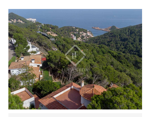
lucasfox.com/go/cbr37561 Sea views, Mountain views, Garden, Exterior

Do not hesitate to contact us for more information about this home with great potential, as a second home and/or as an investment project.