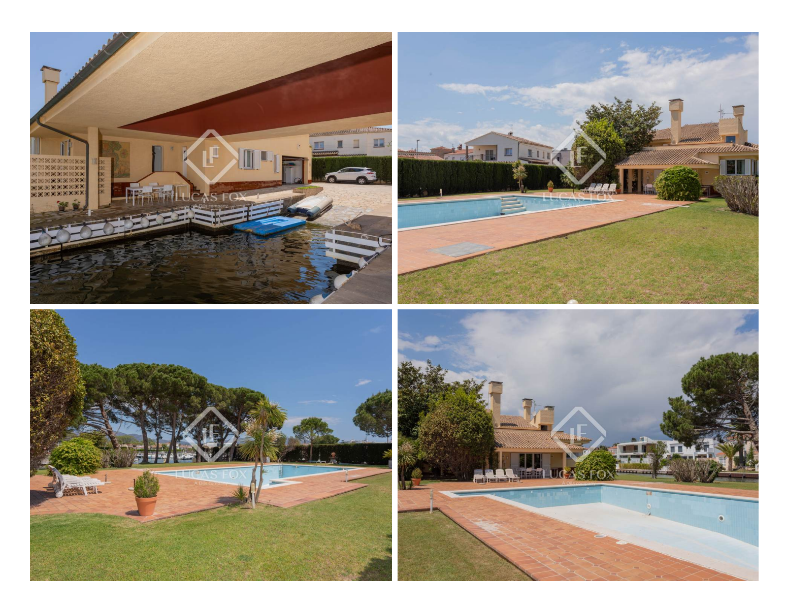
Important Information relating to properties offered by Lucas Fox. Any property particulars are not an offer or contract, nor part of one. You should not rely on statements by Lucas Fox in the particulars or by word of mouth or in writing as being factually accurate about the property, its condition or its value. Neither Lucas Fox nor any associated agent has any authority to make any representations about the property, and accordingly any information given is entirely without responsibility on the part of the agents, seller(s) or lessor(s). Prior the signature of any document concerning the property we recommend that all purchasers consult an independent lawyer and if necessary carry out a survey of the property to ascertain condition / measurements. Areas, measurements and distances given are approximate only and should be checked by the purchaser.

67729m²3,530m²BedroomsBathroomsFloorplanPlot size