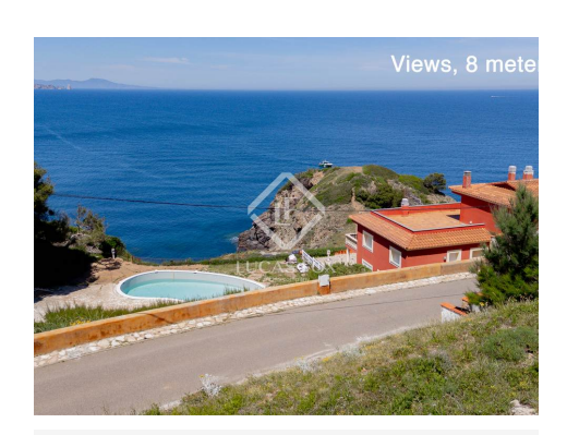
lucasfox.com/go/cbr60119 Sea views

This is a rare opportunity to build a dream home in one of the most picturesque and exclusive areas of the Costa Brava.