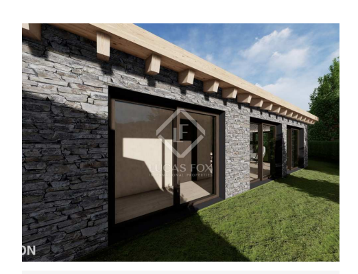
lucasfox.com/go/cer48171 Mountain views, Garden, Private garage, Views, Heating, Exterior

For more information, contact us directly.