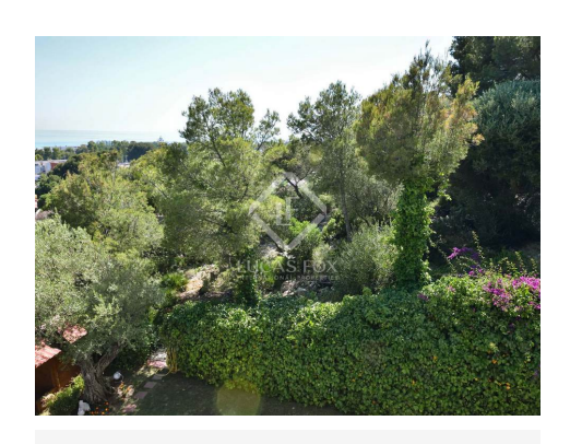
lucasfox.com/go/gav9396 Sea views, Views

This is an ideal plot on which to build a fabulous family home in an excellent location in Castelldefels. Please contact us for further details.