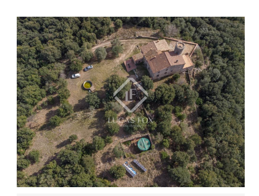
lucasfox.com/go/gir33033 Mountain views, Terrace, Fireplace

A historic property, unique in the area.