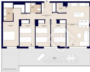
Bloque 1 Esc. 2 P04 B