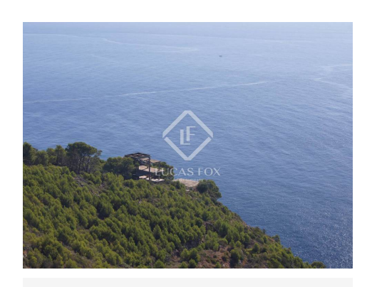
lucasfox.com/go/lfcb880 Waterfront, Sea views

View more Costa Brava luxury first line property for sale.