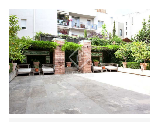
lucasfox.com/go/lfs6530 Sea views, Terrace, Swimming Pool, Lift, Parking

Please contact us for further information.