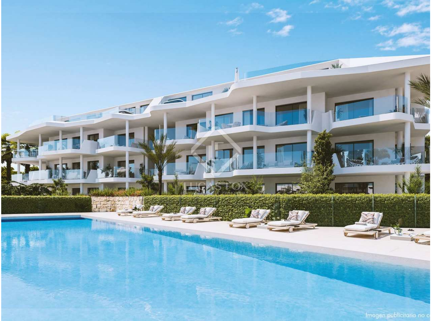
Imagen publicitaria no c

Q4 2024 4 3.0 118m 2 Granted Completion Units available Bedrooms Sizes from Building licence