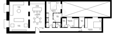
PROPUESTA - PROPOSAL

Contact us for more information about this opportunity in an excellent location.