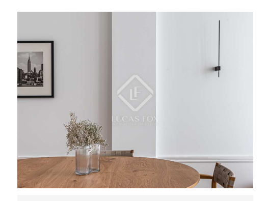
lucasfox.com/go/mad43248 Lift, Renovated, Open kitchen, Interior, Balcony, Air conditioning

For more information or to arrange a visit to this fantastic apartment, do not hesitate to contact Lucas Fox. Our team of professionals will be happy to provide you with all the details and guide you through this exciting process.