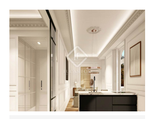
lucasfox.com/go/mad51905 Swimming Pool, Lift, New build, Heating, Exterior, Air conditioning