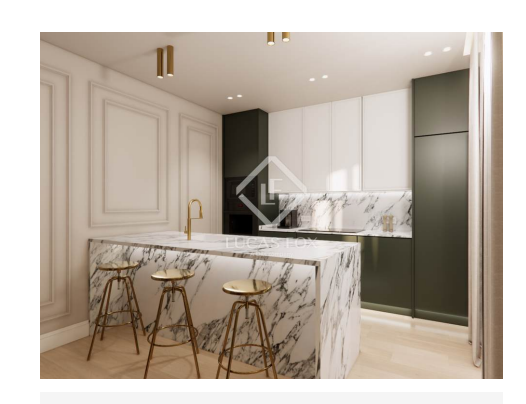
lucasfox.com/go/mad59388 Lift, Interior, Equipped Kitchen, Balcony, Air conditioning

The apartment has individual air conditioning and communal heating, ensuring year-round comfort. Its excellent location, in one of the most prestigious areas with the best dining and shopping options in the capital, makes this property a unique opportunity for both living and investing.