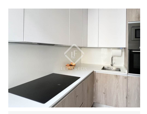
lucasfox.com/go/mad59621 High ceilings, Heating, Exterior, City views, Balcony, Air conditioning

A unique opportunity to live in one of Madrid's most iconic and vibrant areas, in an apartment with classic charm and all modern amenities.