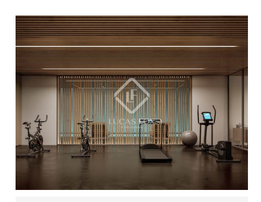
lucasfox.com/go/mad60137 Swimming Pool, Lift, Natural light, Heating, Exterior, Air conditioning