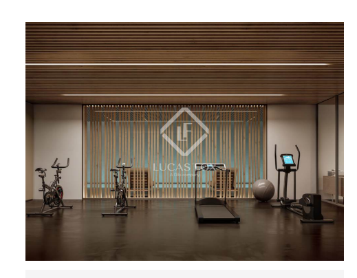
lucasfox.com/go/mad60140 Swimming Pool, Lift, Natural light, Heating, Exterior, Air conditioning