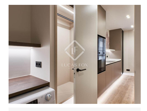
lucasfox.com/go/mad60484 Lift, Renovated, Heating, Equipped Kitchen, Air conditioning

For more information, please do not hesitate to contact us.