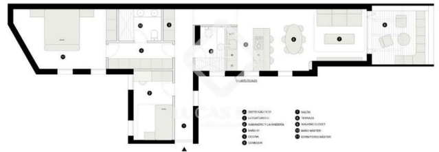
PLANO DE DISTRIBUCIÓN PROPUESTA B

Important Information relating to properties offered by Lucas Fox. Any property particulars are not an offer or contract, nor part of one. You should not rely on statements by Lucas Fox in the particulars or by word of mouth or in writing as being factually accurate about the property, its condition or its value. Neither Lucas Fox nor any associated agent has any authority to make any representations about the property, and accordingly any information given is entirely without responsibility on the part of the agents, seller(s) or lessor(s). Prior the signature of any document concerning the property we recommend that all purchasers consult an independent lawyer and if necessary carry out a survey of the property to ascertain condition / measurements. Areas, measurements and distances given are approximate only and should be checked by the purchaser.