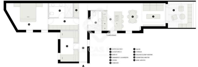
PLANO DE DISTRIBUCIÓN PROPUESTA C