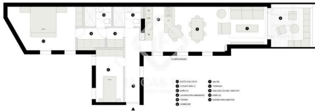
PLANO DE DISTRIBUCIÓN PROPUESTA A