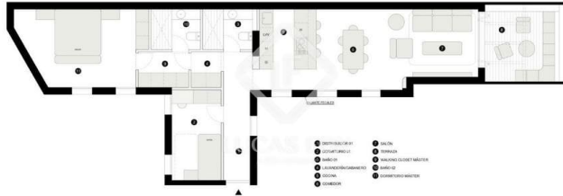
PLANO DE DISTRIBUCIÓN PROPUESTA D