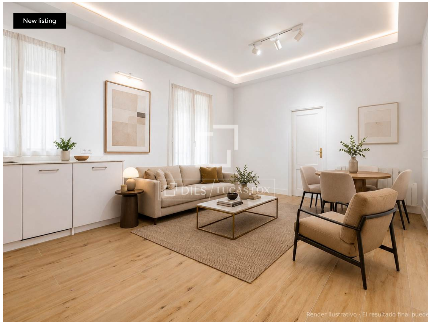
Render ilustrativo · El resultado final puede