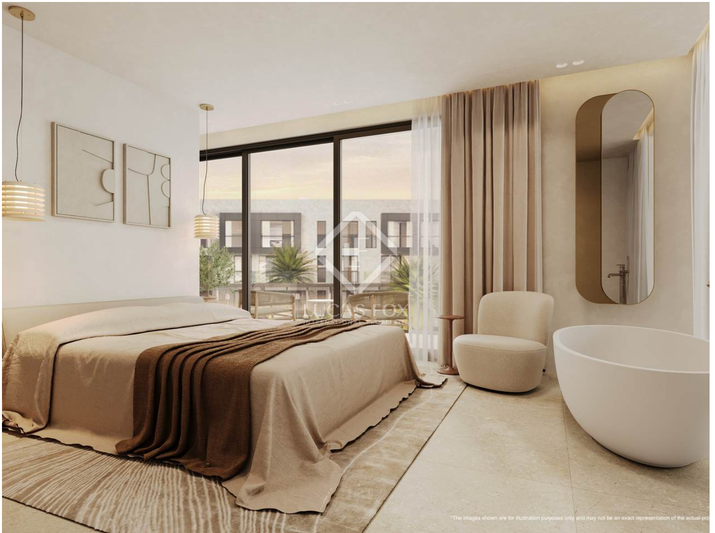
*The images shown are for illustration purposes only and may not be an exact representation of the actual product.

3 Bedrooms 3 Bathrooms 249m 2 Floorplan 99m 2 Terrace