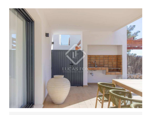
lucasfox.com/go/men37953 Terrace, Swimming Pool, Garden, Private garage, New build

Contact us for more information or to arrange a visit.