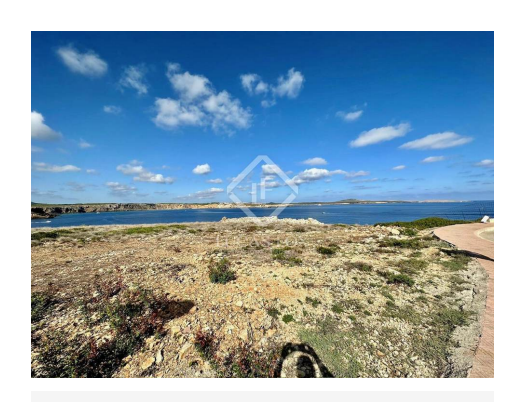
lucasfox.com/go/men44734 Sea views, Views

Contact us for more information or to arrange a viewing.