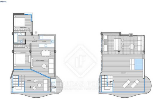
Islio A DO 7C RECE DE VIVENDA 59.40 m² RECE DE SOLVREM 74.22 m² NAS m²