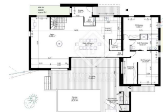
RBC Surface habitable: 115,20 m 2 Surface totale: 130,20 m 2 Surface annexes: 25,00 m 2

Contact us today for more information or to arrange a viewing