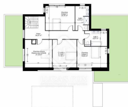
ETAGE Surface habitable: 111,20 m 2 Surface totale: 132,20 m 2