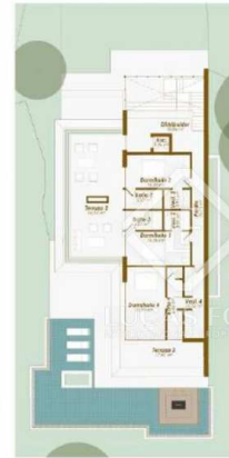
VIVIENDA 5 - Planta Alta