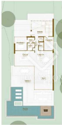
VIVIENDA 5 - Planta Baja

4 Bedrooms 357m 2 Floorplan 1,157m 2 Plot size 370m 2 Terrace