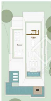
VIVIENDA 5 - Solarium