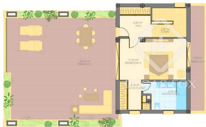
BLOCK D6. PENTHOUSE FLOOR 'LEFT' 38+38

The present document has strictly informative character; it may suffer variations for technical, legal and/or urban requirements. The function is purely informative; all measurements are approximate. GRAPHIC SCALE: 1 0 1 2 3 4 5 10 PROYECTO: C/ Lucas Fox PROYECTO: A/ JORDAN