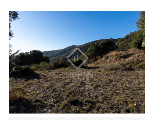
lucasfox.com/go/mrs39461 Sea views, Mountain views, Views