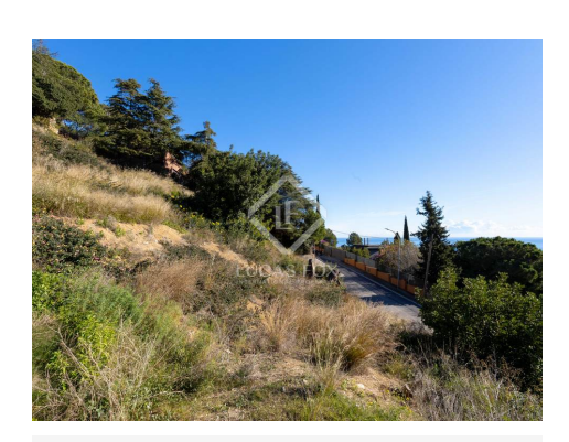
lucasfox.com/go/mrs55648 Sea views, Mountain views, Garden, Natural light, Views, Transport nearby, Panoramic view, Near international schools, Exterior, City views