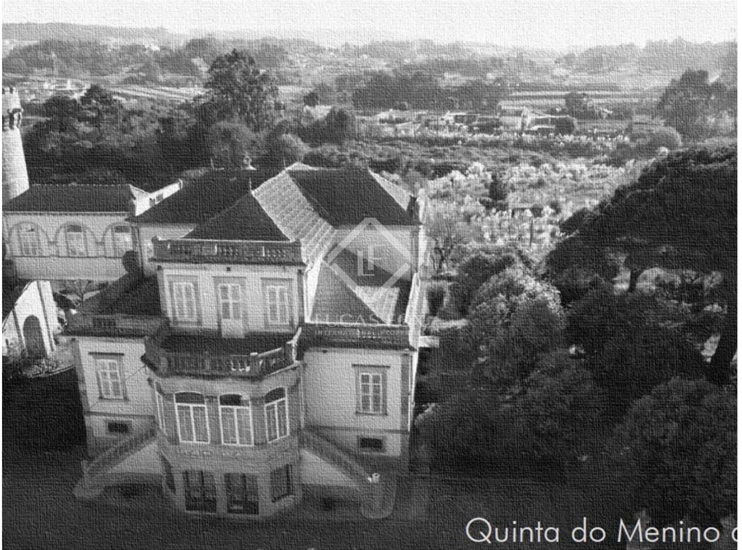
Quinta do Menino d

6 5 1,095m 2 57,000m 2 Bedrooms Bathrooms Floorplan Plot size