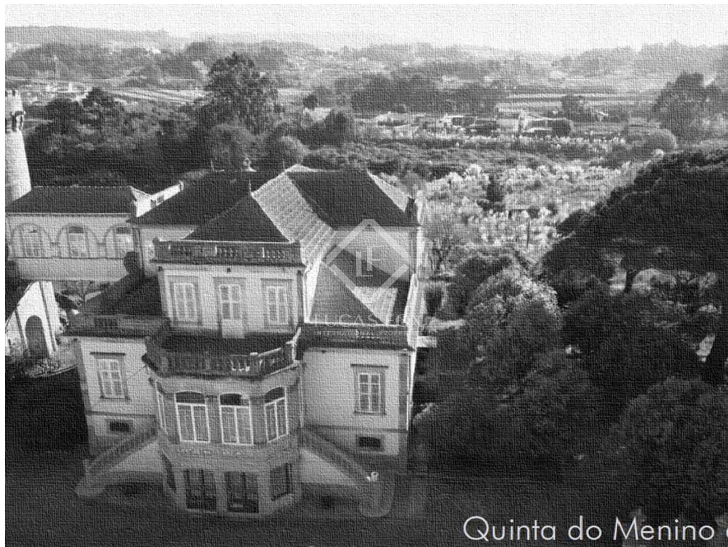
Quinta do Menino d

6 5 1,095m 2 57,000m 2 Bedrooms Bathrooms Floorplan Plot size