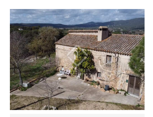
lucasfox.com/go/pda48633 Garden, Well, Horse-riding facilites