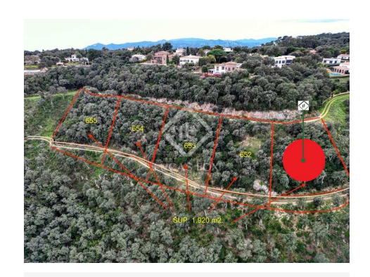
lucasfox.com/go/pda49498 Sea views

An exceptional opportunity for anyone who wants to build a dream home to their liking next to the sea.