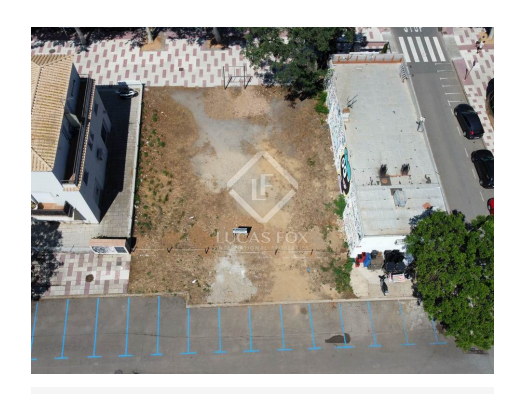
lucasfox.com/go/pda51680 Natural light, Views, Transport nearby, City views

For more details about this plot for sale, please get in touch via our website or call us on the telephone number provided.