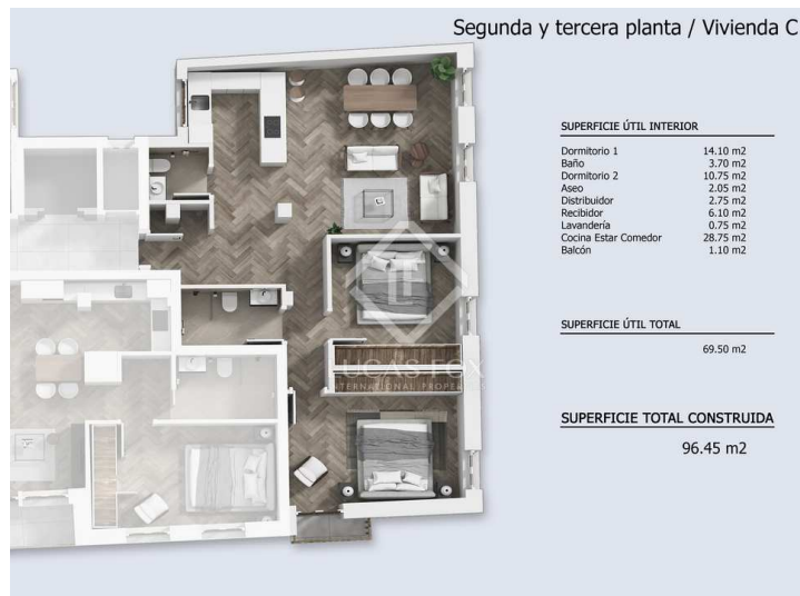
Segunda y tercera planta / Vivienda C

Important Information relating to properties offered by Lucas Fox. Any property particulars are not an offer or contract, nor part of one. You should not rely on statements by Lucas Fox in the particulars or by word of mouth or in writing as being factually accurate about the property, its condition or its value. Neither Lucas Fox nor any associated agent has any authority to make any representations about the property, and accordingly any information given is entirely without responsibility on the part of the agents, seller(s) or lessor(s). Prior the signature of any document concerning the property we recommend that all purchasers consult an independent lawyer and if necessary carry out a survey of the property to ascertain condition / measurements. Areas, measurements and distances given are approximate only and should be checked by the purchaser.