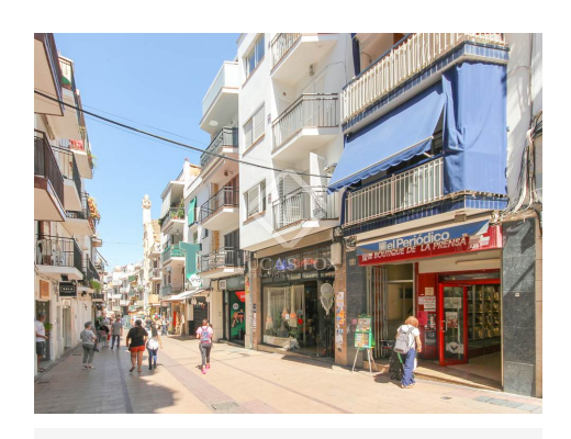
lucasfox.com/go/sit50984 Exterior, Equipped Kitchen, Balcony, Air conditioning

Do not miss your opportunity to live in the centre of Sitges, and contact us for more information.