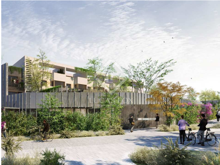
Vivienda B, C, D

5 Bedrooms 4 Bathrooms 300m 2 Floorplan 175m 2 Plot size 66m 2 Terrace 48m 2 Garden