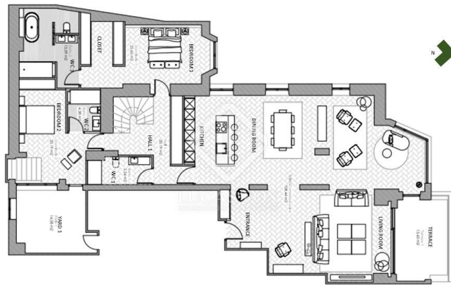
PROJECT OP. 1