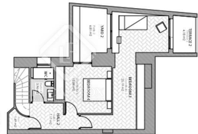
GROUND FLOOR (L -1)