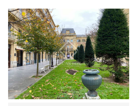
lucasfox.com/go/ssb44705 Lift, Renovated, Interior, Equipped Kitchen