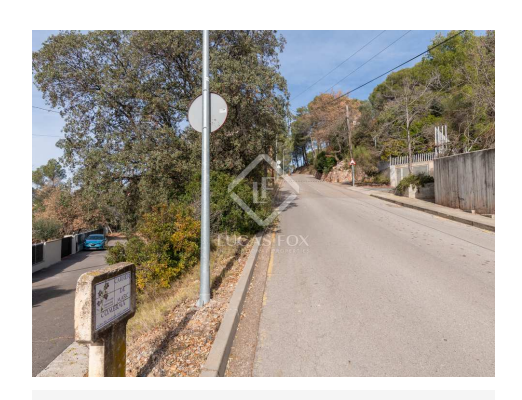
lucasfox.com/go/stc47503 Garden, Natural light, Views, Near international schools, Exterior