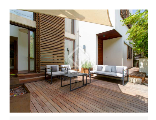
lucasfox.com/go/tar37168 Terrace, Swimming Pool, Garden, Exterior,

On the upper floor, a passage hall locates a study area between the rooms. It is distributed as 4 double rooms. A master suite with dressing room, fireplace and terrace. Two double rooms for children and share a bathroom. A fourth bedroom suite with bathroom.