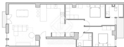
PROPUESTA DE REFORMA