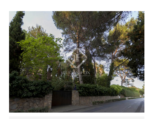
lucasfox.com/go/val41010 Swimming Pool, Garden