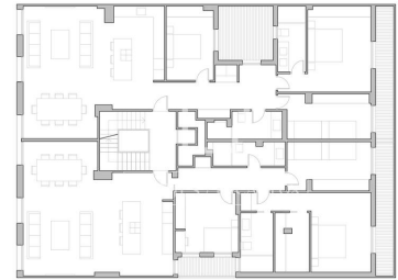
PROYECTO SEGREGACIÓN Los planes se realizan con fines informativos y orientativos para representar una posible segregación interior. No constituyen un documento técnico para ejecución de obra, proyecto, licencia, valoración o cualquier otro fin, y no debe utilizarse como base para la toma de decisiones técnicas o jurídicas.

Dils Lucas Fox (Lucas Trading, SL) is registered in the Register of Real Estate Brokerage Agents of the Valencian Community with number RAICV 4243.