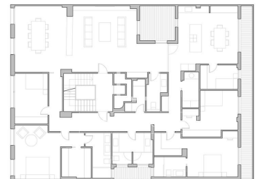
PROPUESTA REFORMA Este plano se realiza con fines informativos y orientativos para representar una posible reforma interior. No constituye un documento técnico para ejecución de obra, proyectos, licitación o cualquier otro fin, y no debe utilizarse como base para la toma de decisiones técnicas o jurídicas.

Contact us today for more information or to arrange a viewing