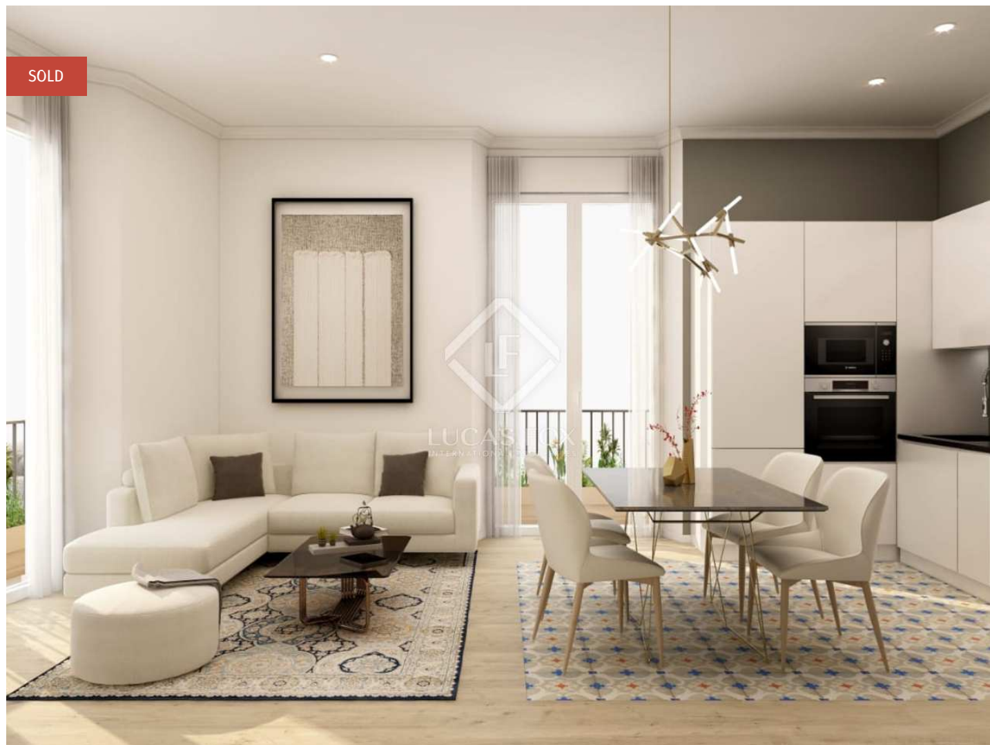
view General - Planta Terraza

2 Bedrooms 1 Bathrooms 76m 2 Floorplan 89m 2 Terrace