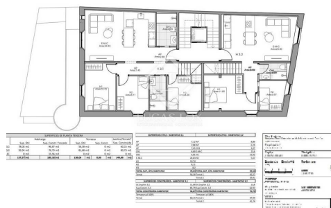
view General - Planta Cocina