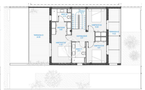
PROJECTE BÀSIC / DISENYOL D'UN HABITATGE UNIFAMILIAR AMB PISCINA PLÀNOLS D'ARQUITECTURA A.0

Contact us today for more information or to arrange a viewing